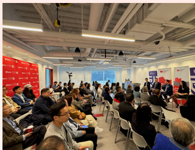
Guests at the 2025 ACCE Mandarin Speaking event.