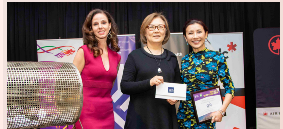
Guests received prizes at the ACCE West Coast Gala.