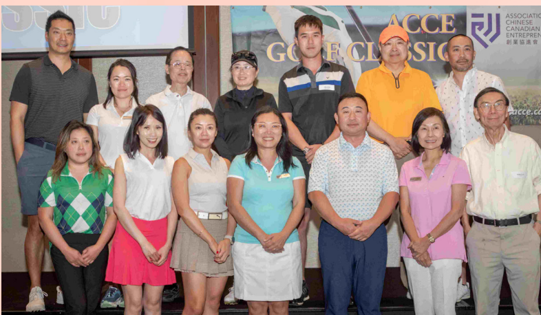
ACCE directors at the ACCE Golf Classic.