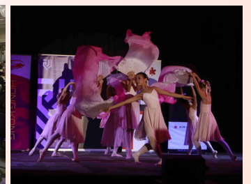
Guests at the 2025 ACCE West Coast Gala.