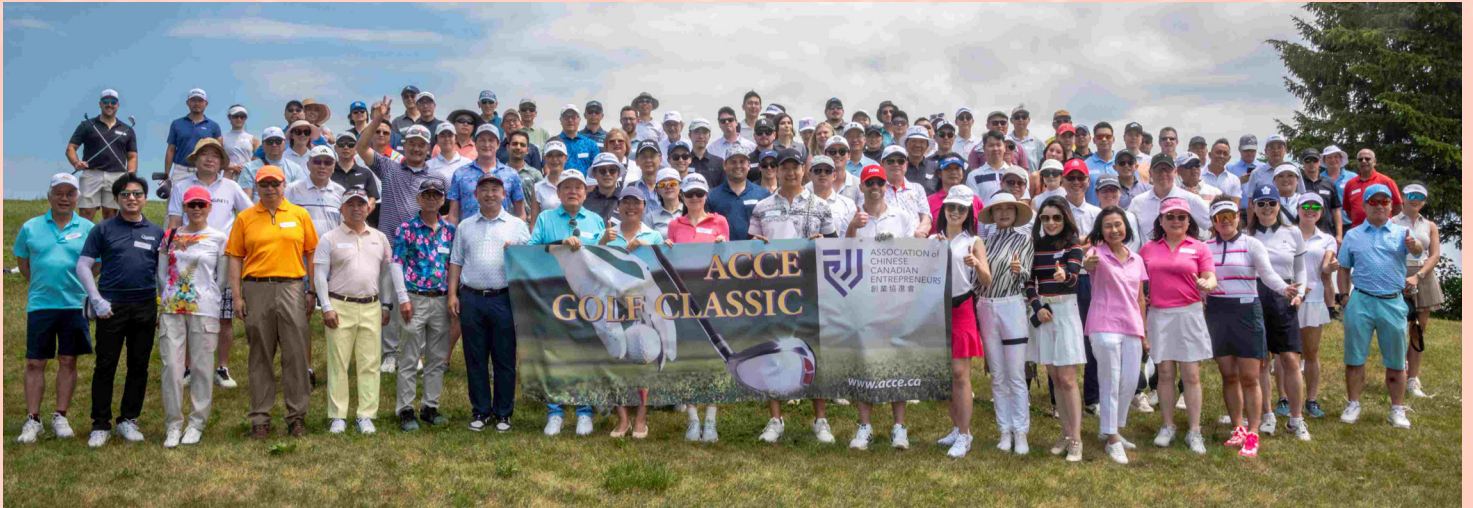
The 2025 ACCE Golf Classic was held on June 25, 2025, at Angus Glen Golf Club. Participants took a group photo before the competition started.