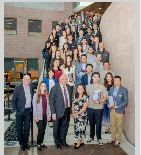
Guests at the ACCE Appreciation Reception.