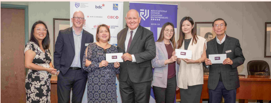
Guests receive prizes at the ACCE Appreciation Reception.