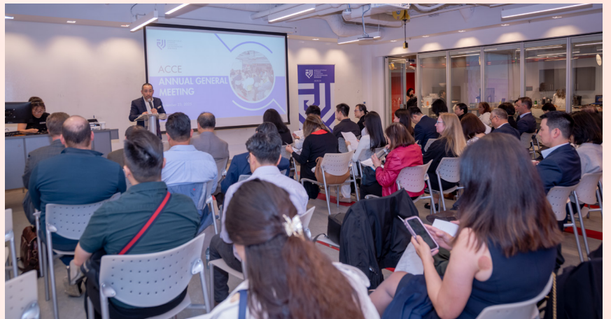
Guests at the ACCE Annual General Meeting.