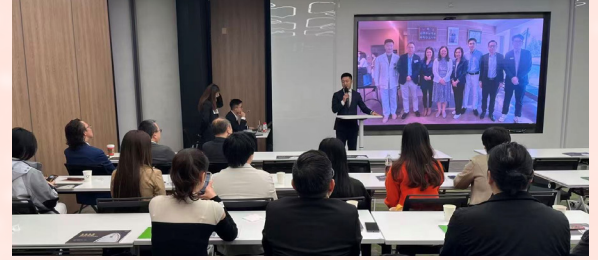
Guests at the 2025 ACCE Fireside Chat event in China, "Building a Winning Business in Canada."