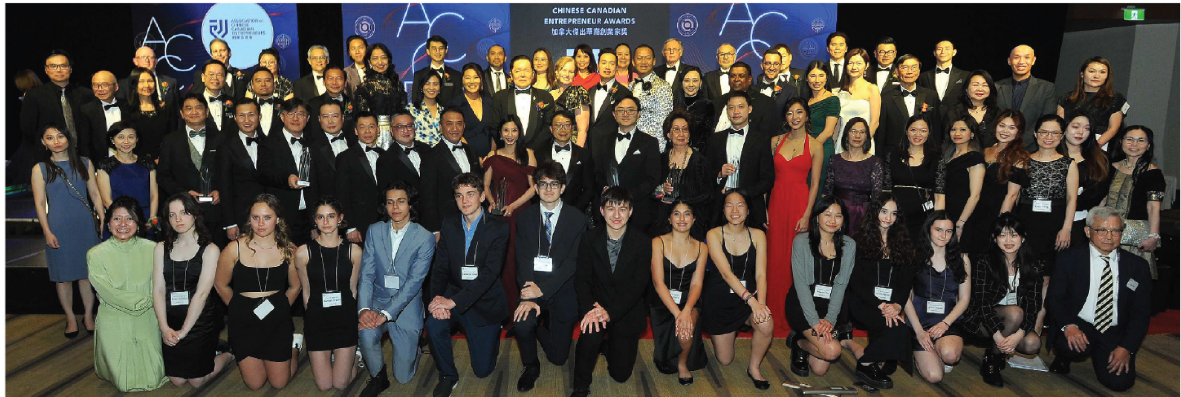
All winners, sponsors, guests, volunteers and ACCE directors gathered at the 26 th ACCE Chinese Canadian Entrepreneur Awards Gala on April 15, 2023, at the Metro Toronto Convention Centre.