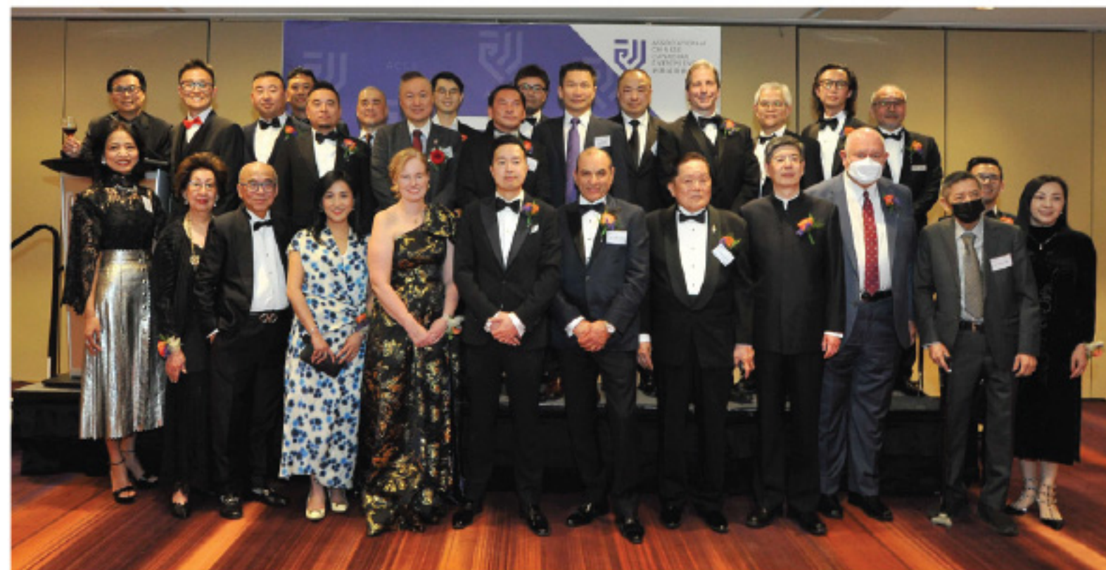
Past ACCE award winners and dignitaries gathered at the 2023 ACCE Awards Gala.