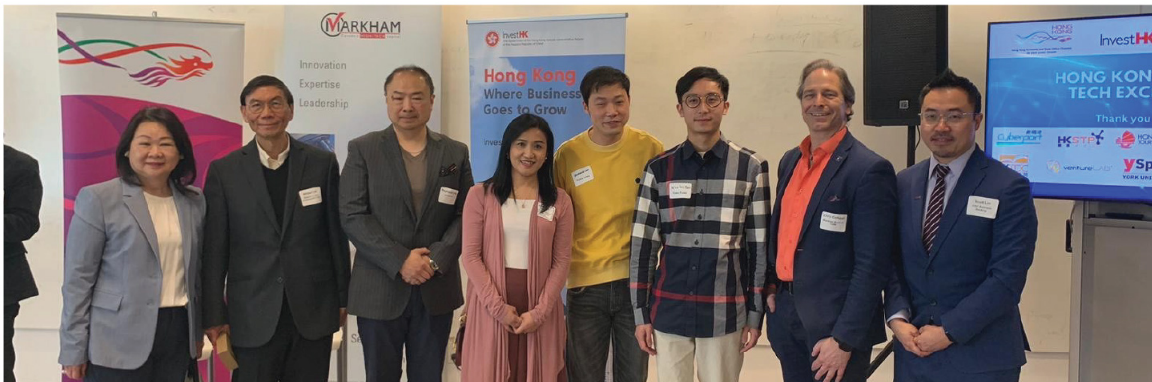
ACCE was one of the supporting organizations at the Hong Kong – Markham Tech Exchange on May 10, 2023.