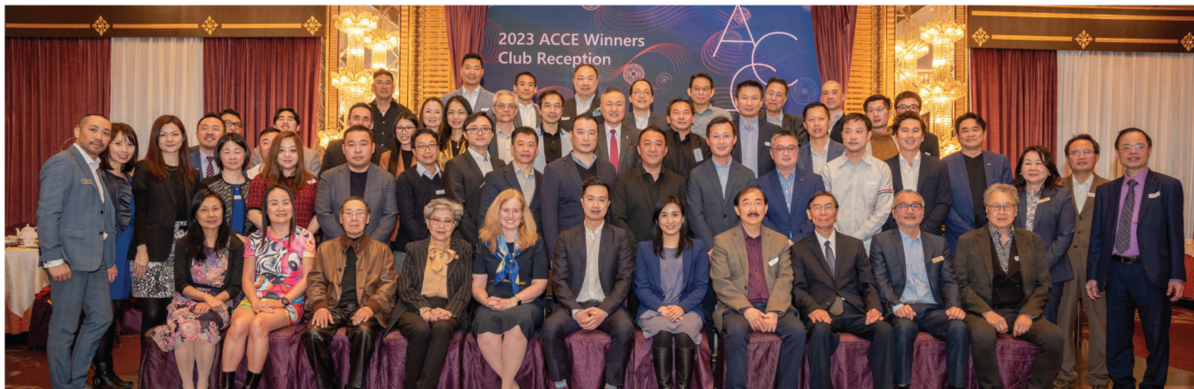
The 2023 ACCE Winners' Club reception, sponsored by BDC, was held on April 27, 2023, at the Casa Victoria Fine Dining and Banquet. Sponsors, guests, past award winners, and ACCE Board of Directors members and advisors are shown.