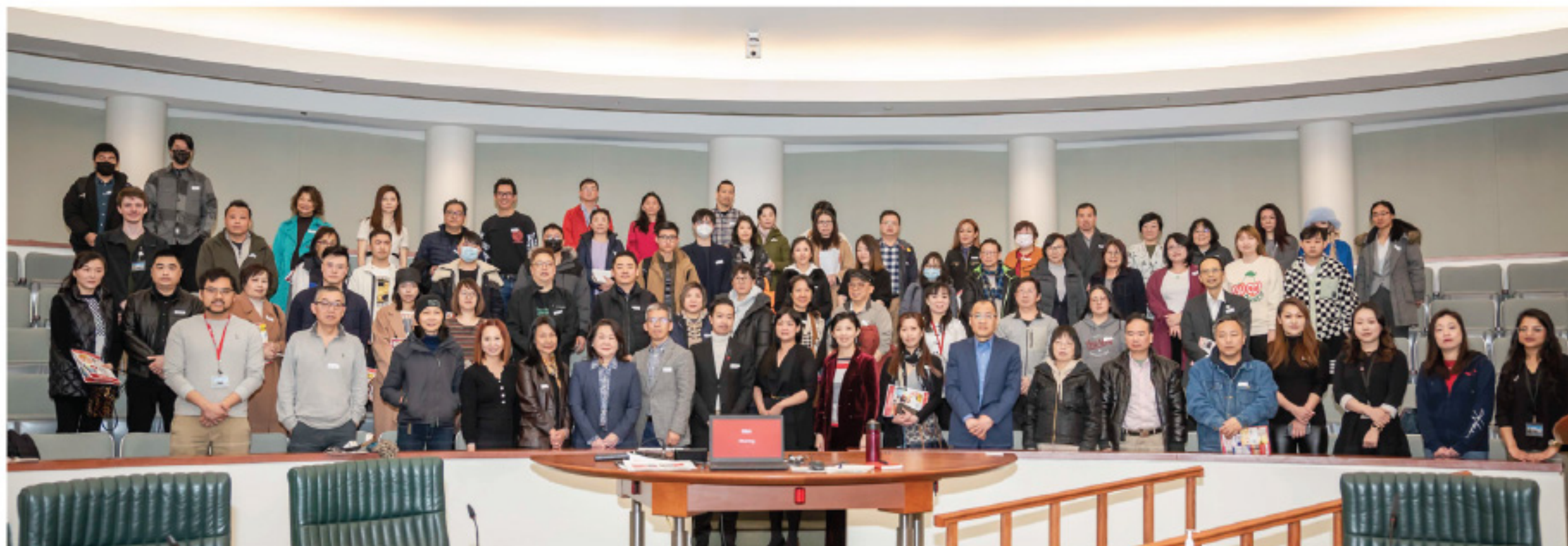
Guests attended the Mandarin Speaking workshop.