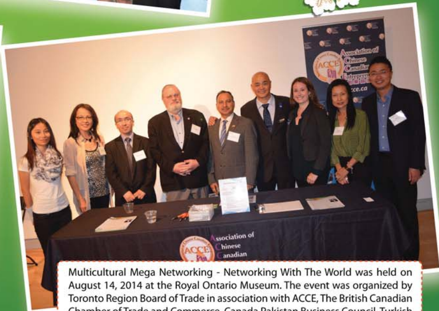
Multicultural Mega Networking - Networking With The World was held on August 14, 2014 at the Royal Ontario Museum. The event was organized by Toronto Region Board of Trade in association with ACCE, The British Canadian Chamber of Trade and Commerce, Canada Pakistan Business Council, Turkish Canadian Chamber of Commerce and other associations.