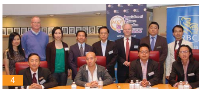
2. The ACCE West Coast committee members visited Mayor of Saskatoon in May. (Left 5): His Worship Donald Atchison.