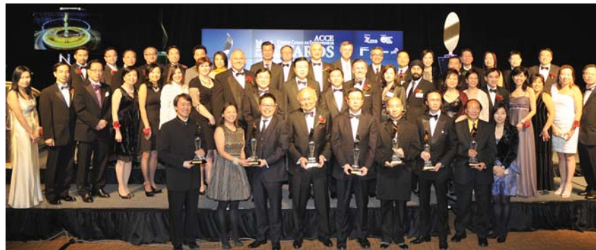
▲ All winners, sponsors, guests and ACCE Directors at 2012 ACCE Chinese Canadian Entrepreneur Awards Gala.