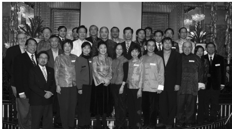
▲ Guests, directors and past winners at Chinese New Year party.