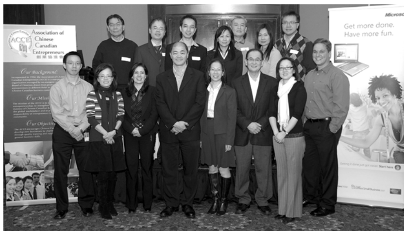
▲ Microsoft Learning and Presentation Event sponsored by Samtack.