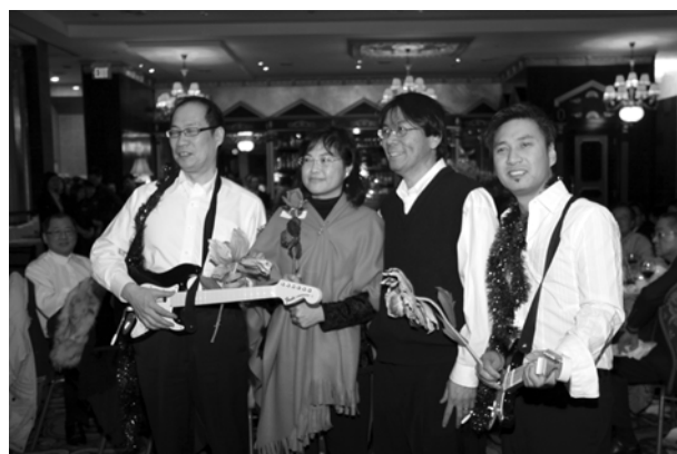
▲ "The BaBa" team at Christmas party.