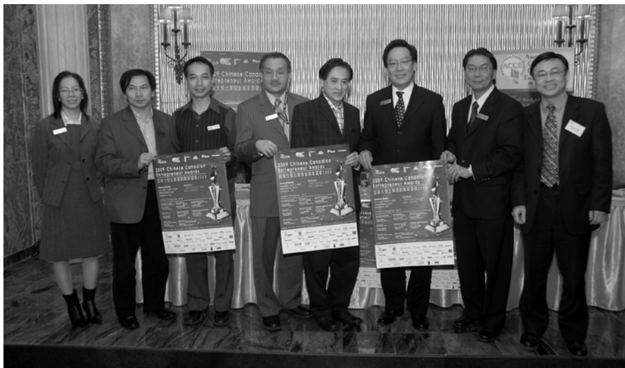
▲ Past winners and past presidents promote entrepreneurship at networking night.

► Guests and directors of ACCE at March monthly networking night.