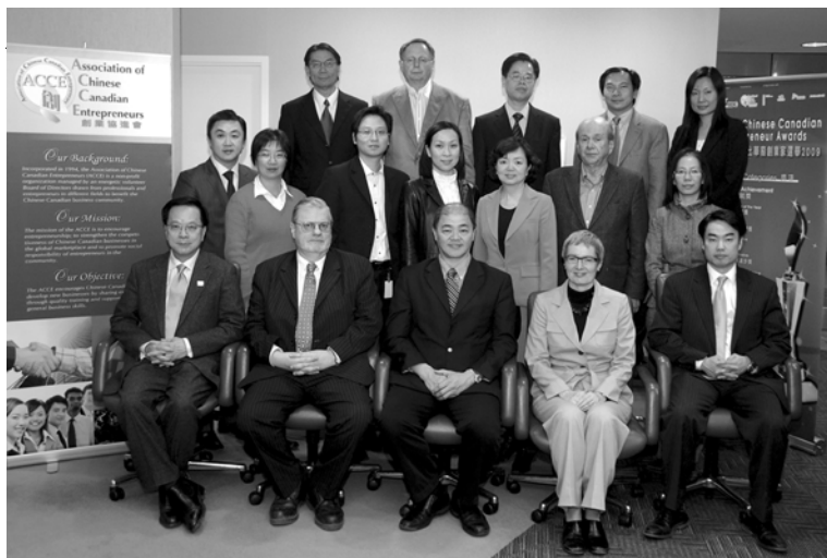
▲ Steering committee members of the 2009 Chinese Canadian Entrepreneur Awards.