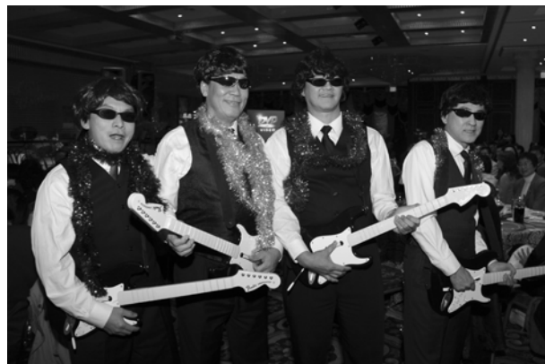
▲ "The Beater" team at Christmas party.

A Microsoft Learning and Presentation Event was held on February 19, 2009 . The presentation was focused on the applications of Windows Office under the Windows Vista environment. We understood that there were needs for this from our members, especially owner managers, to obtain better efficiencies in using Microsoft programs. The presentation was put on by a representative from Microsoft, who flew all the way from U.S. It was interactive and attendees asked numerous questions. Attendees not only upgraded their skills but were offered a special price for Microsoft products at the venue.