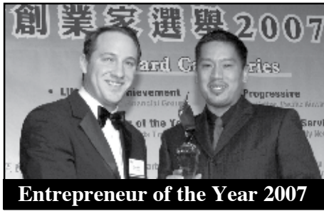
Entrepreneur of the Year 2007