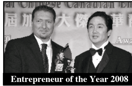
Entrepreneur of the Year 2008